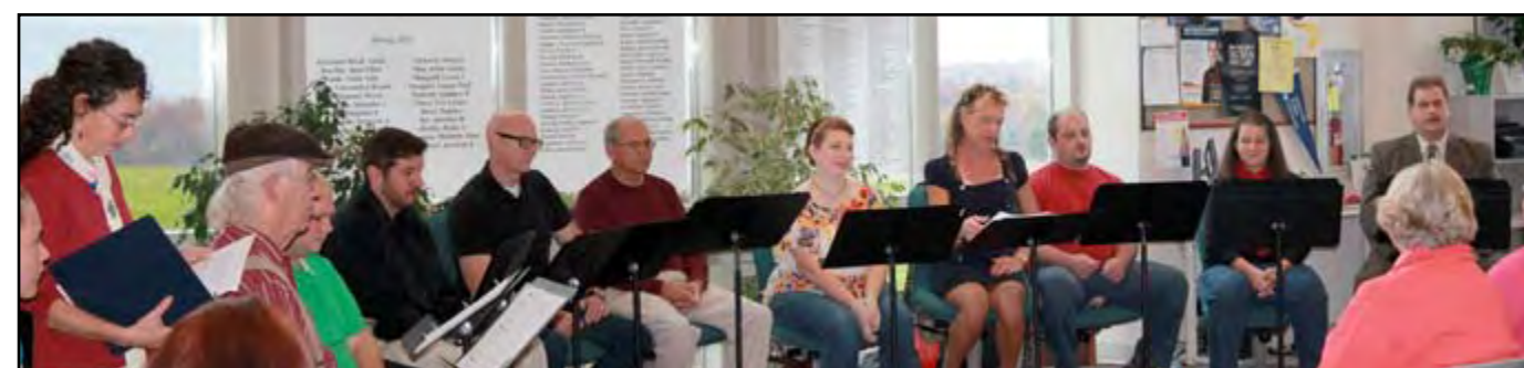
Eastern Celebrates Appalachian Heritage, Diversity and Resiliency with a performance of Revelations .