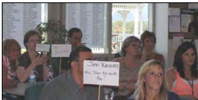
Preparation for the HLC Reaccreditation Site Visit