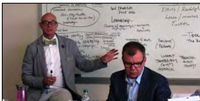
Eastern hosts first Creative Arts Summit.