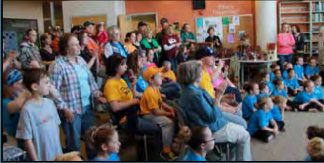
Spring 2013 Extravaganza Event