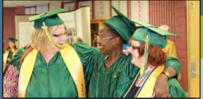
May 2013 Commencement Ceremony

316 Eastern Drive Moorefield, WV 26836 Tel: 304-434-8000 Fax: 304-434-7000 E: ask@easternwv.edu