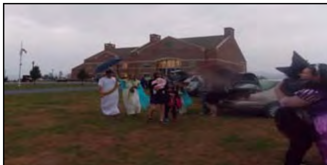
Trunk N Treat Fall Open House