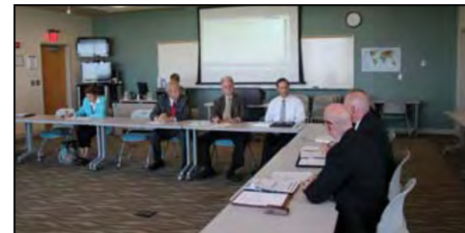
Potomac Highlands District Consortium & Economic Development Partnership