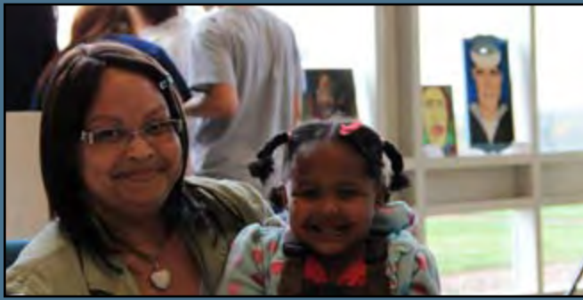
Spring 2013 Art Show