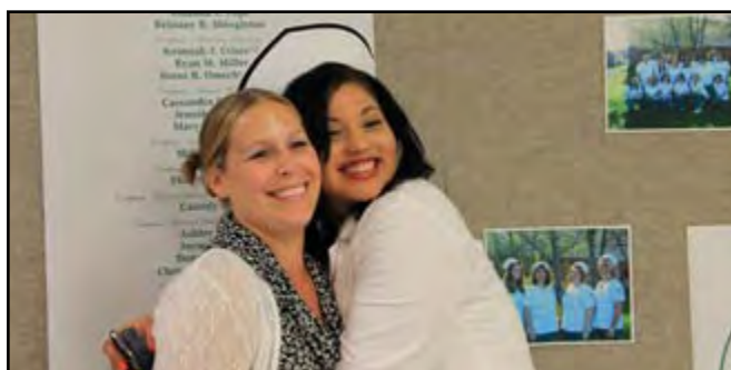
Nursing Pinning Ceremony