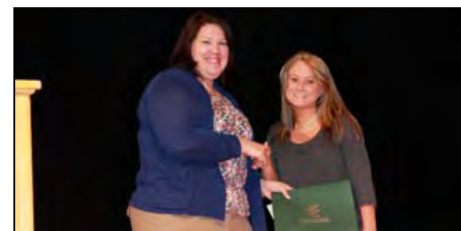
Annual Awarding of Eastern Scholarships to High School Graduates