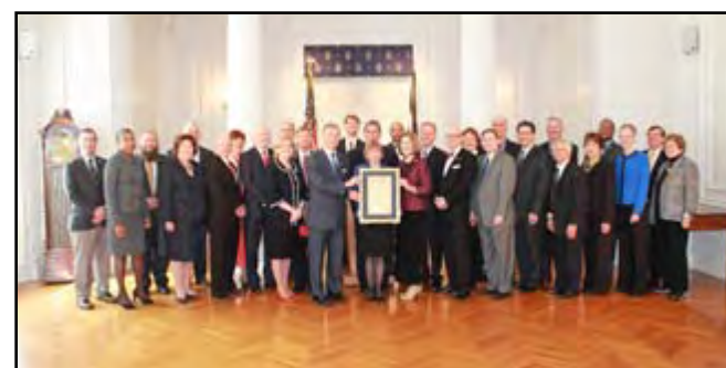
Higher Education Day in Charleston, WV