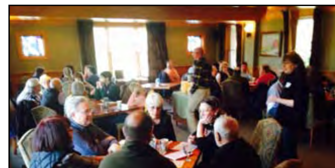
Lost River Arts Meeting