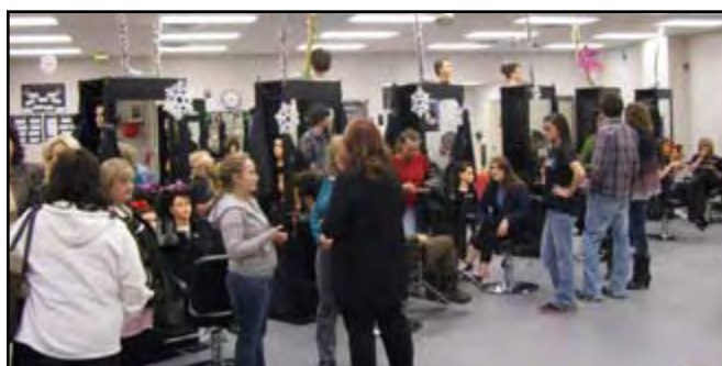
Adult Cosmetology Program opens at South Branch Vocational Center, a partnership program with Eastern.